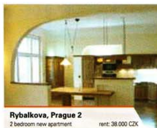
Rybalkova, Prague 2 2 bedroom new apartment rent: 38 000 CZK