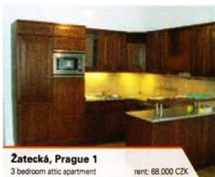
Zatecká, Prague 1 3 bedroom attic apartment rent: 68 000 CZK

Our residential leasing team will take care of all your housing needs.