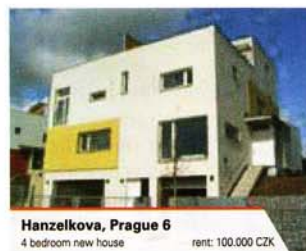
Hanzelkova, Prague 6 4 bedroom new house rent: 100 000 CZK